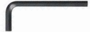
5/32" Allen Wrench